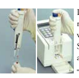
Draw the sample and reference solution with the Twin-pipette. Set the pipette and apply.